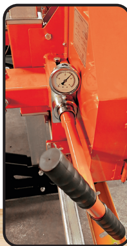
Blade tensioning device