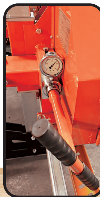
Blade tensioning device