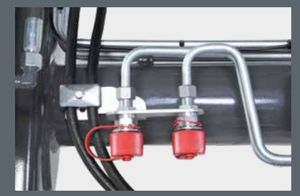
Using hydraulic implements effectively – thanks to the third pilot circuit, there is no need for an additional control unit.