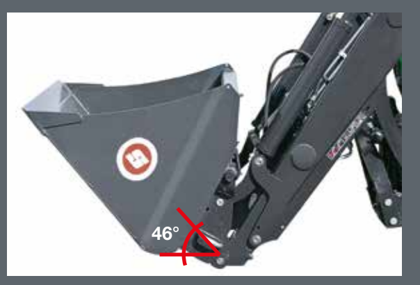
Nothing falls out: Thanks to the excellent tilt angle, there are no trickle losses when loading.