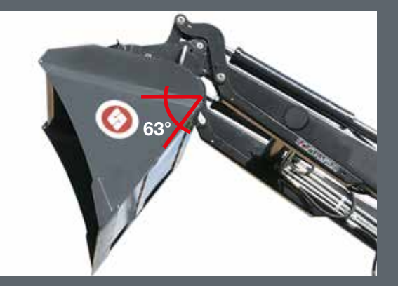
Then the bucket is completely empty – the dump angles for the implement provide efficient results.