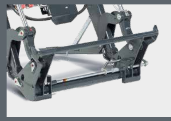
All implements with the Euro-mount fit with the Euro quick release frame.