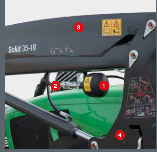
The Comfort-Drive is protected between the drive-in column and the lifting arm bar. It can be switched on and off with the stopcock.