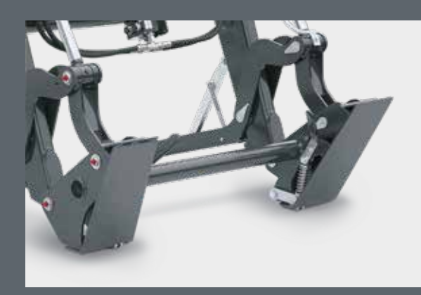
The Skid Steer quick release frame provides a clear view of the implement – ideal when working with the bale spike or pallet fork.

STOLL's tilt and dump angles put them in a different league. In models of this size, the Solid with a tilt angle of up to 46 degrees and a maximum dump angle of 63 degrees is in a class of its own.