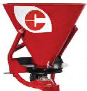
Painted steel hopper