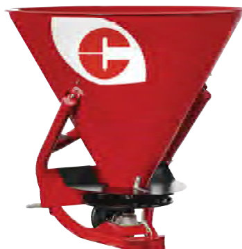
Painted steel hopper