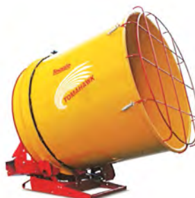
T5050-2 1,80m (6') drum