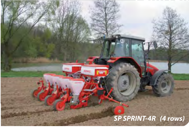
SP SPRINT-4R (4 rows)