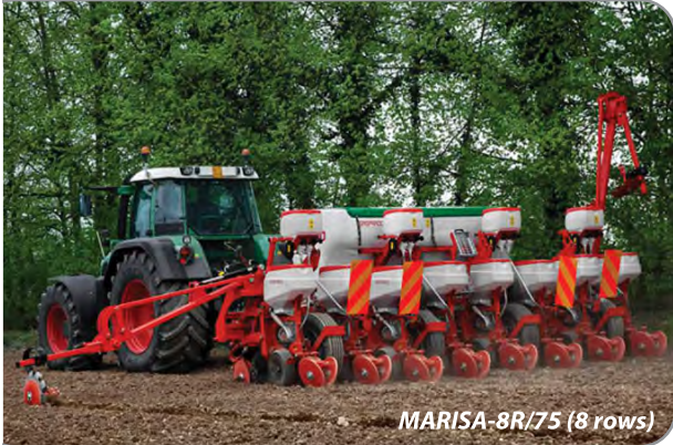
MARISA-8R/75 (8 rows)