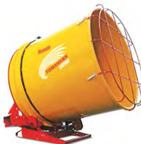
T505M-002 1,80m (6') drum