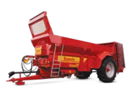
TITAN 17 Up to 18.9 m<sup>3</sup>