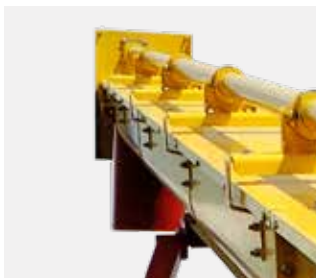
Solid Tube Guard

Complete with all-wheel drive, standard hydraulic steering, and rugged all-terrain tires capable of handling tough terrain, this compact mover kit gives better access to large diameter hopper bins and a sharper turning radius.