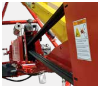
Triple Banded Belts