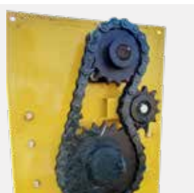
Adjustable Chain Tensioner