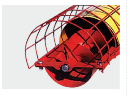
Optional bolt-on flight support bushing with grease fitting (standard on 13" models).