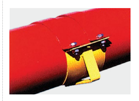
Optional bolt-on tube clamps for attaching support bracing.