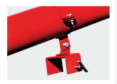
Handy swivel mount bracket for quick mounting to truck box, wagon or feed bin.