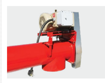
Upper drive has heavy-duty flangette ball bearing and adjustable motor mount with double "B" belts and pulley (triple belts on 13" models).