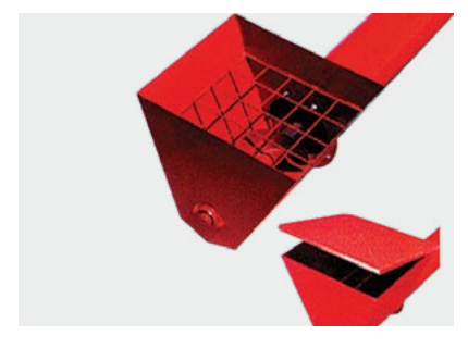
Optional handy steel hopper with flight support bearing. Also available with hinged lid for 6" to 10" models.